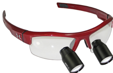
Igniter Frame - Crimson Color EDGE Hybrid Technology High Magnification Through The Lens Loupes