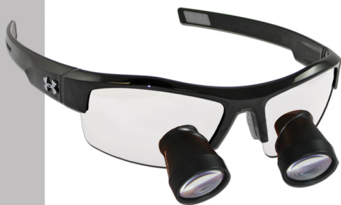
Igniter Frame - Black Color 2.5x Ultra-Lightweight Through The Lens Loupes