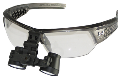
Enforcer Frame - Graphite Color 2.5x Ultra-Lightweight Flip-Up Loupes

The versatile combination of Under Armour Performance Eyewear & SheerVision Optics provides you with the ultimate collaboration within the surgical magnification arena. Talk about strong teamwork - when Under Armour's strong yet lightweight eyewear is matched with SheerVision's award-winning designs enables the manufacturing of the lightest high-performance loupes in the game.